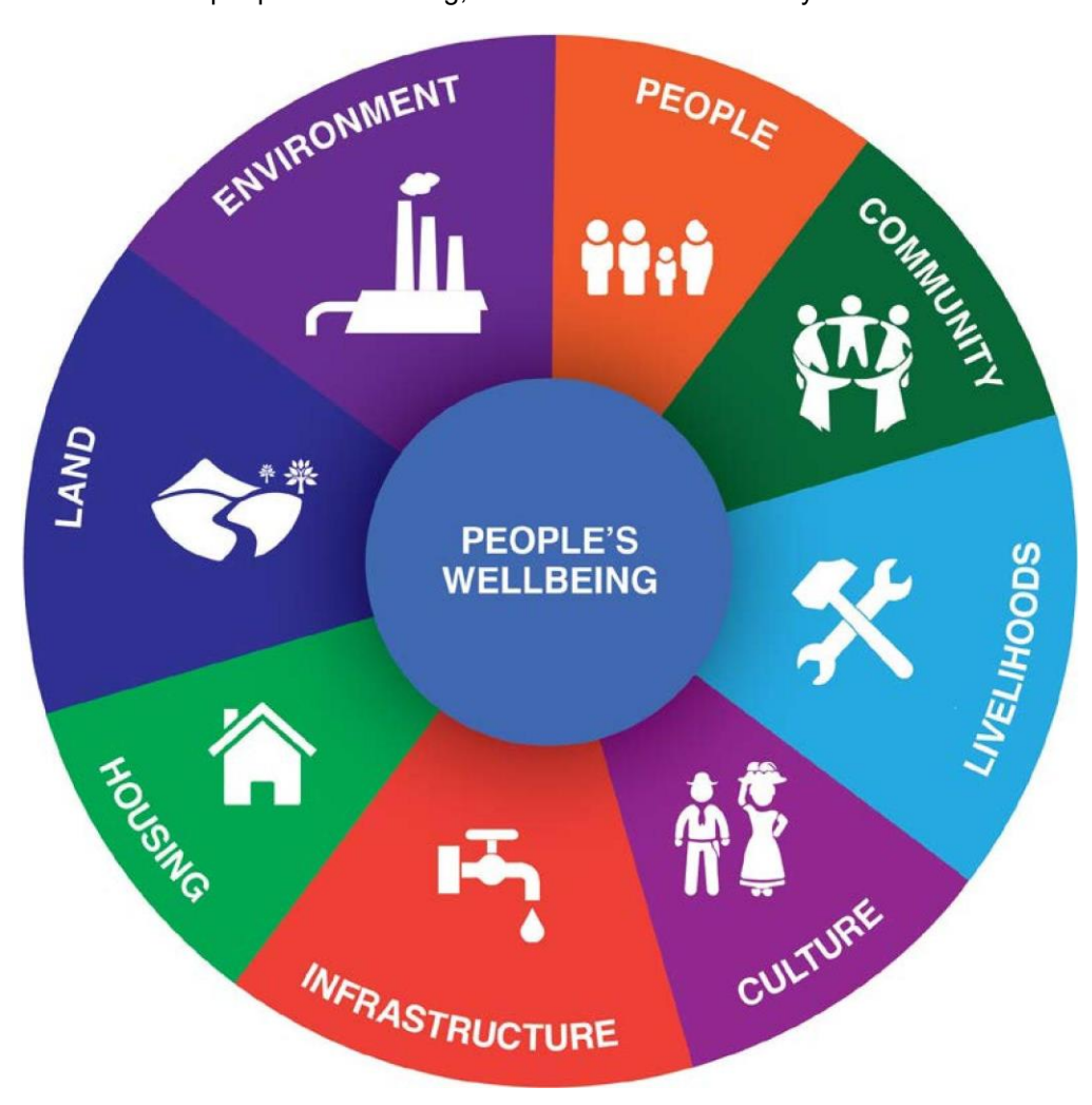
Figure 3: The Social Framework for Projects

An approach was recently developed by Smyth and Vanclay – known as The Social Framework for Projects (Figure 3) to understand and define the social context of a proposed project.<sup>39</sup> The A key feature of this framework is its focus around people's "well-being," and how it is influenced by different factors.