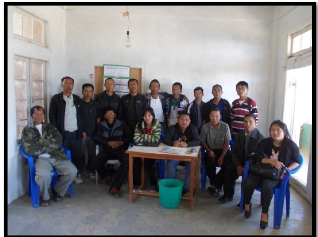
Physical and Documents inspection Mualpheng