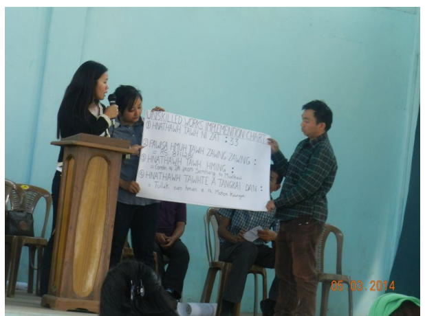
Lungleng - I