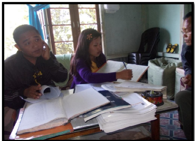
Physical and Documents inspection Tualbung