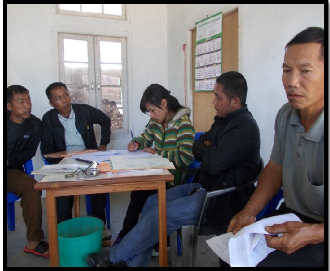
Physical and Documents inspection Keifang