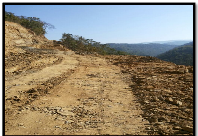
Works taken up, Sihmui