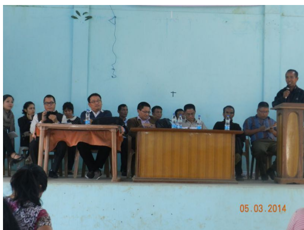
Lungleng – I